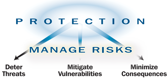
Figure S-1: Protection